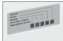
SS AISI 304