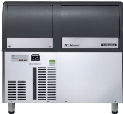
Routine Maintenance Alarm